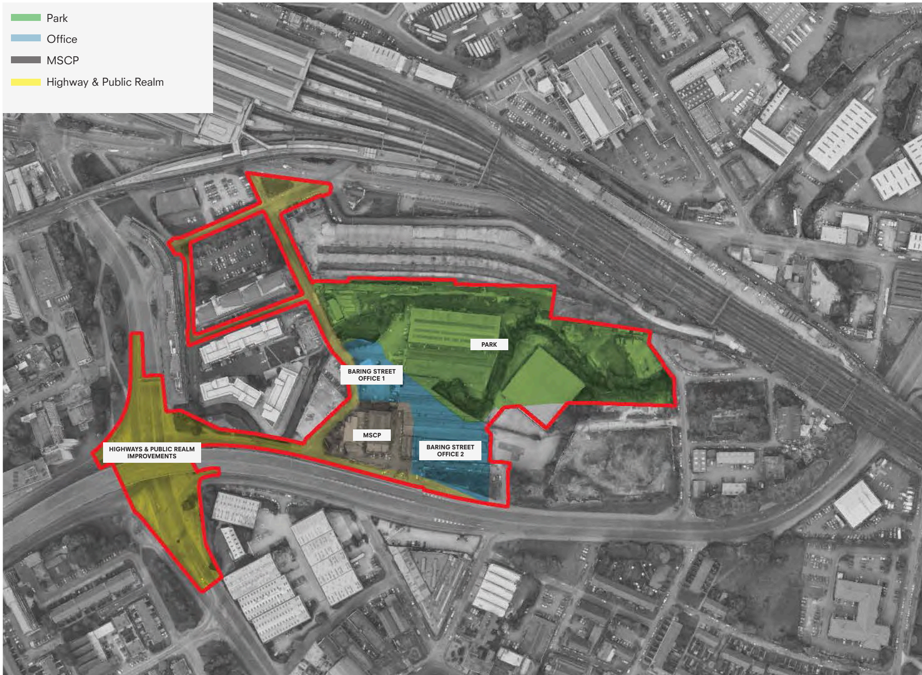
Illustrative diagram showing Mayfield SRF Phase 1 boundary and included applications