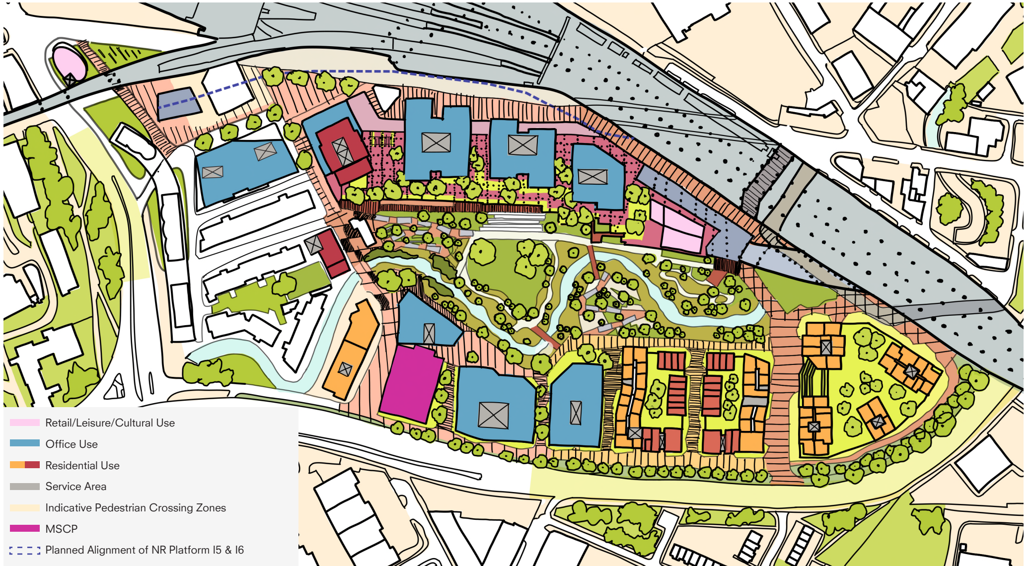
Illustrative masterplan - typical upper level