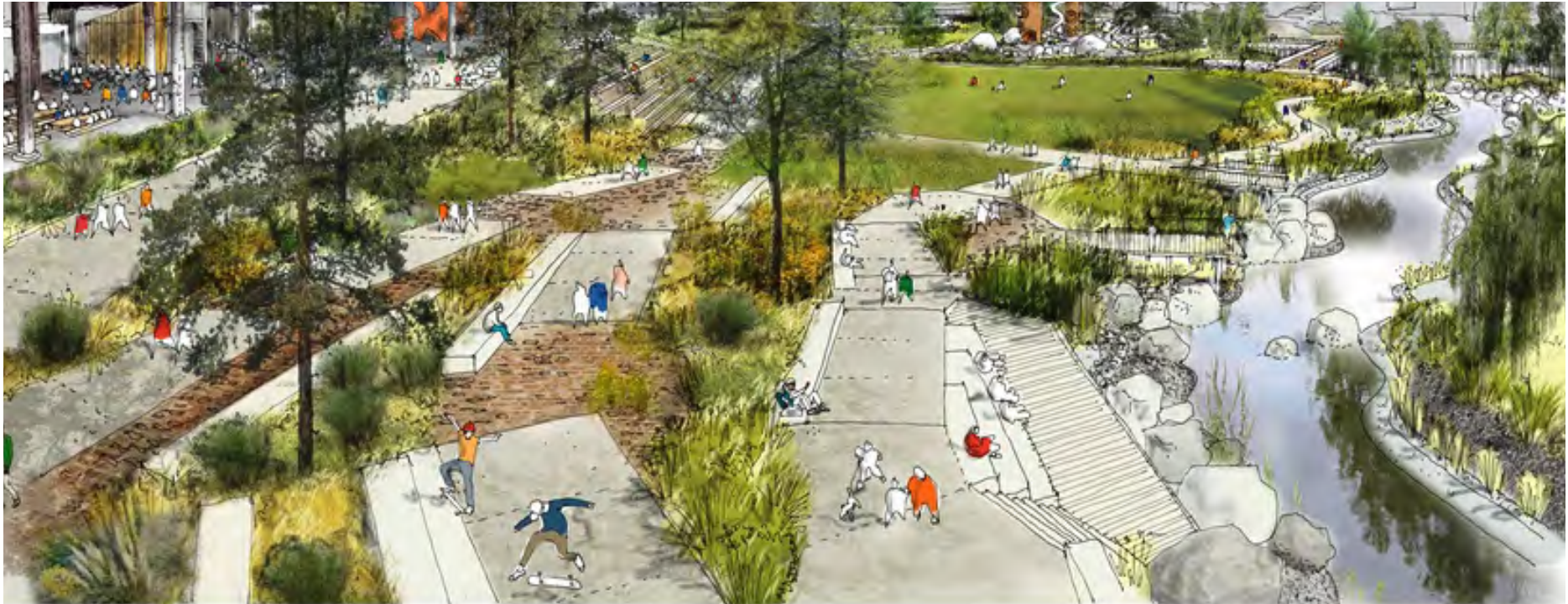
Illustration of Mayfield Park from The Gatehouse on Baring Street