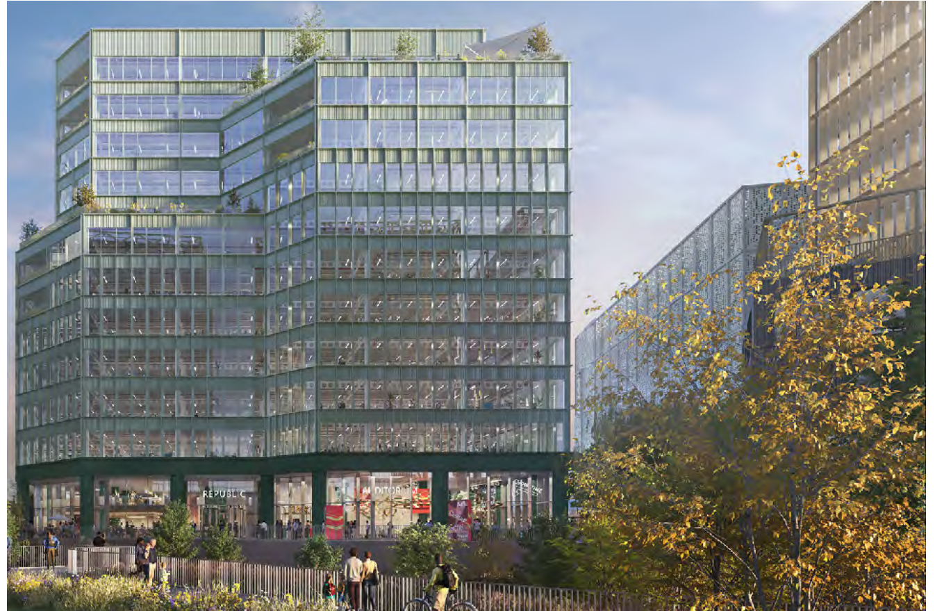
Baring Street Office 2 with the MSCP and Baring Street Office 1 to the right