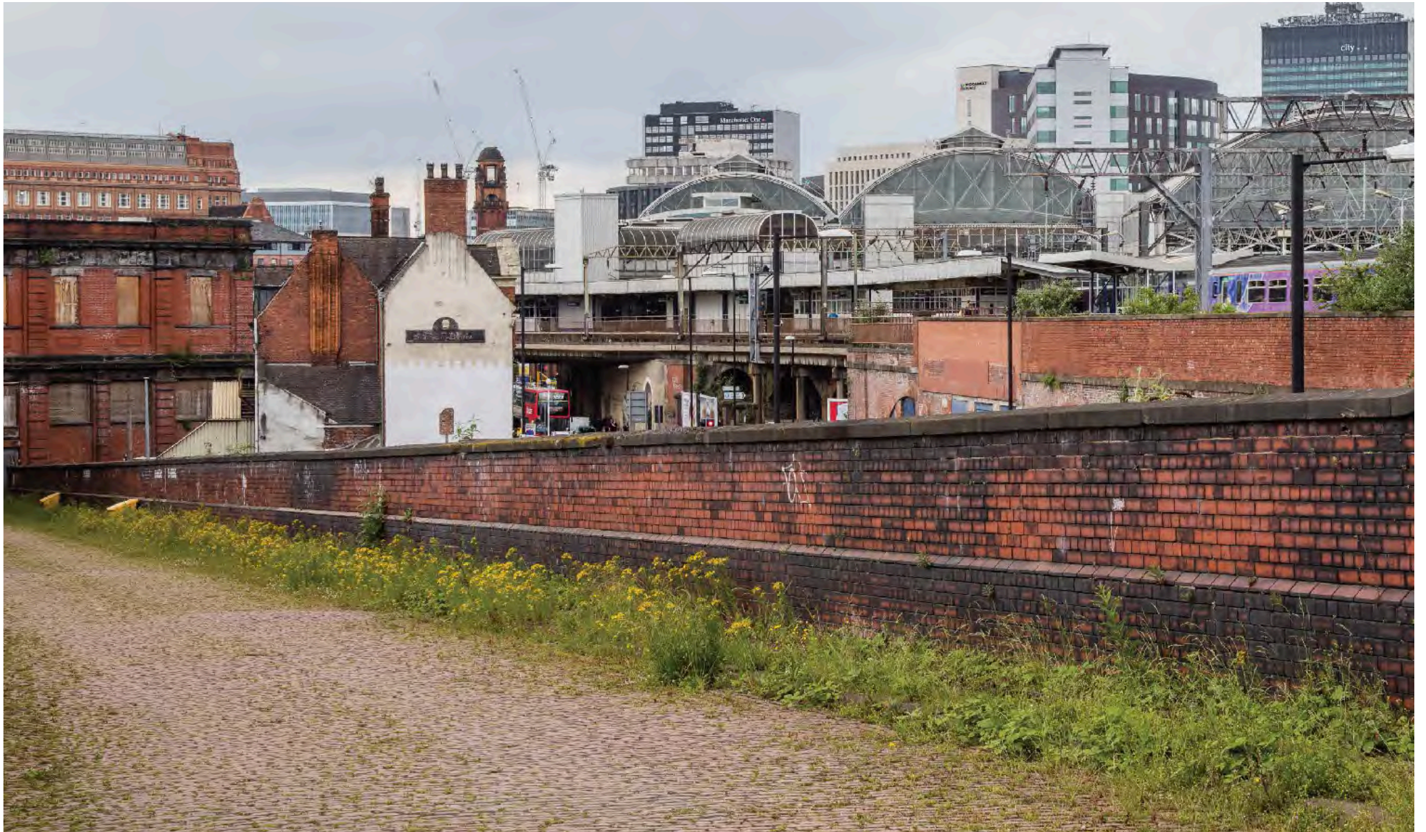
Looking towards the Ticket Hall