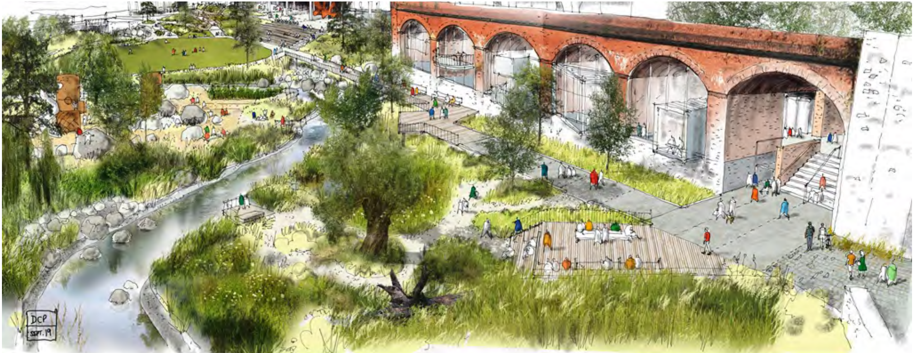
Illustration of Mayfield Park from Hoyle Street