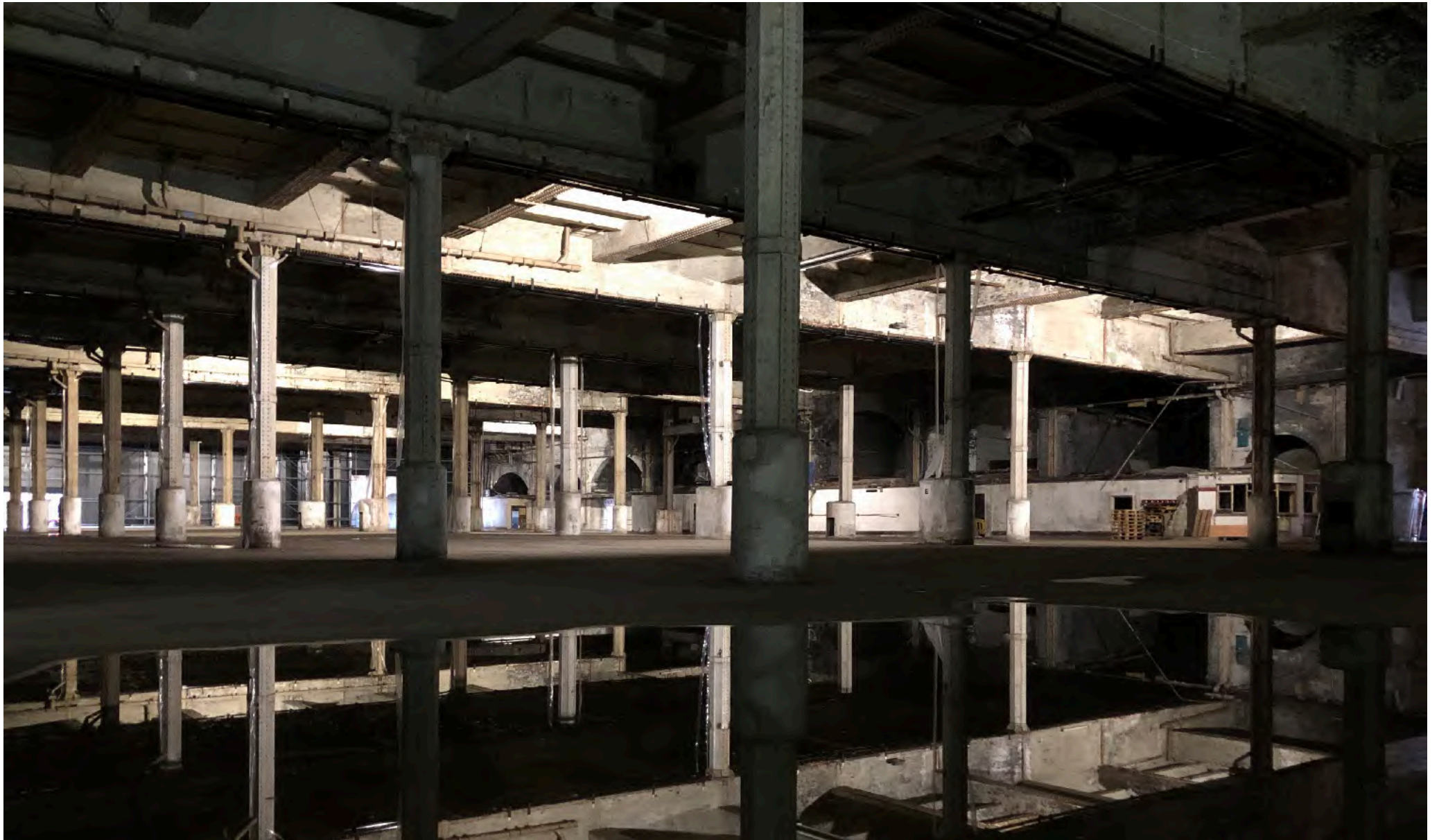
Inside the existing Depot