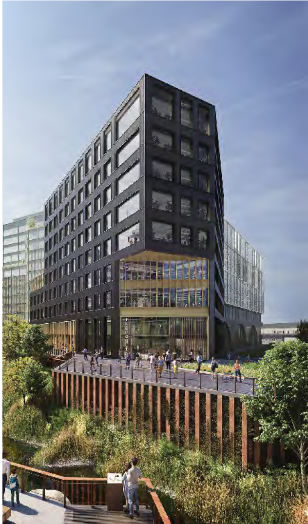
Artist's render of Baring Street Office 2 (left) and Baring Street Office 1 (right)