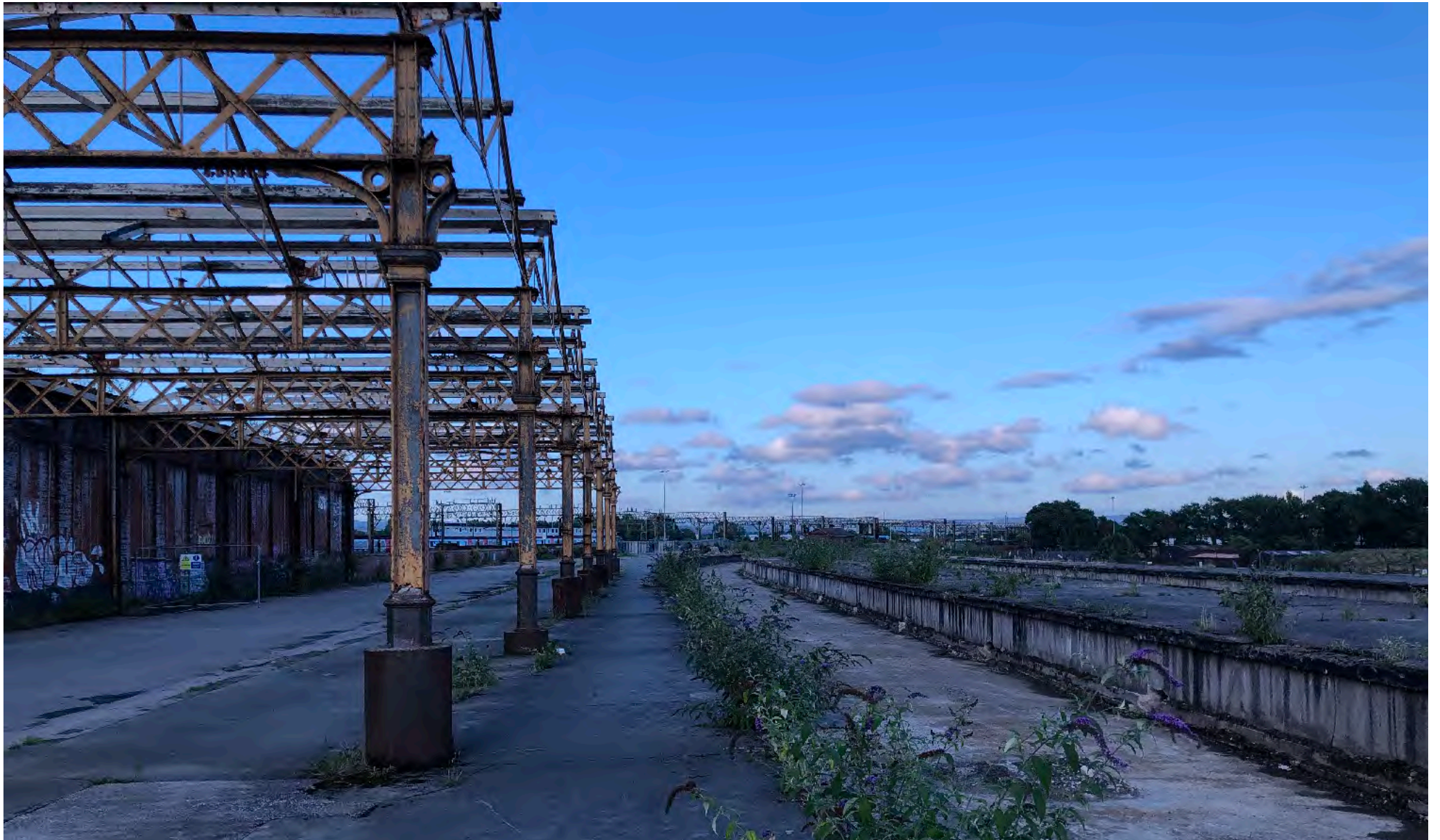
On the platform of The Depot