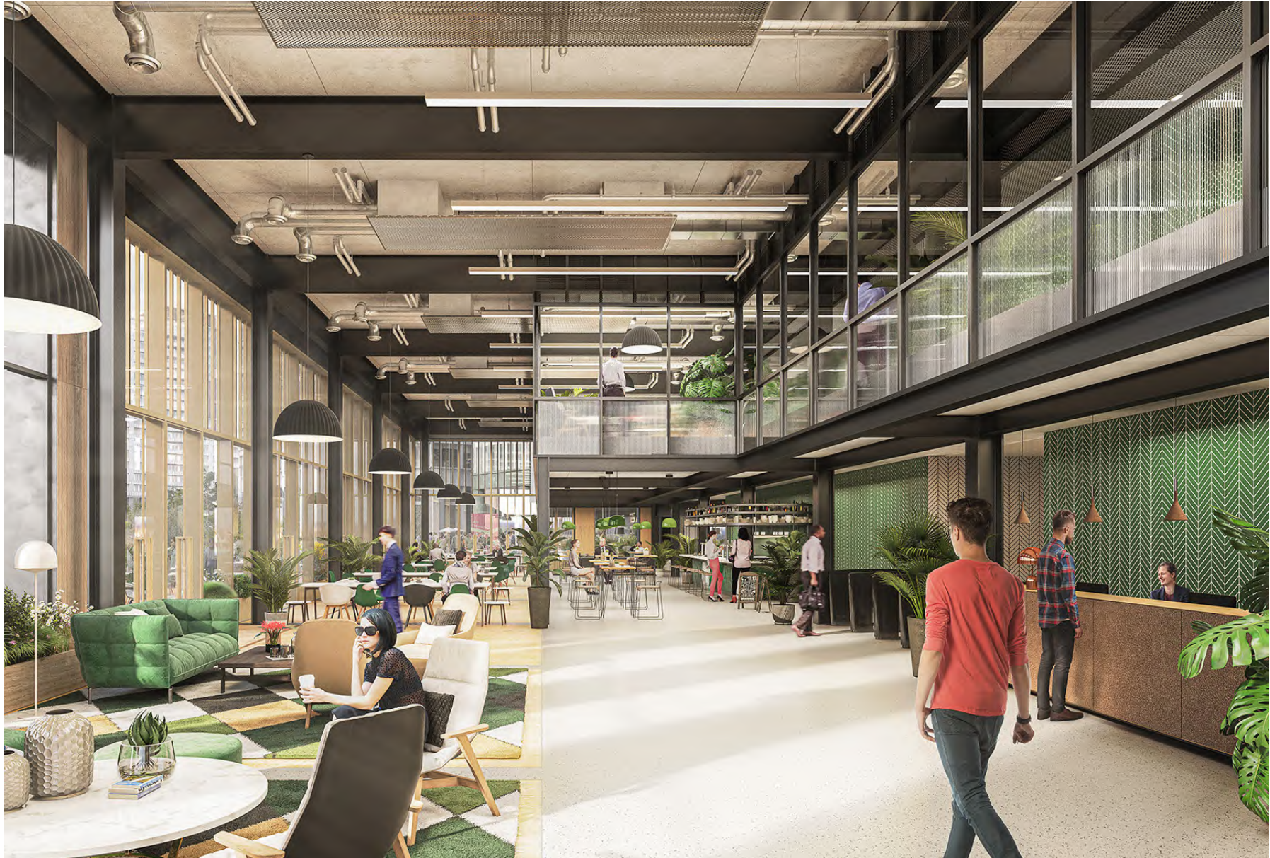
The ground level of Baring Street Office 1